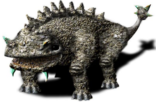
Illustration © 2001, Frederic Simons

The elemental beast of earth can move as swiftly and as easily through earth and rock as it does above ground. Its favored attack method is to erupt from under the surface and surprise its victims. When attacking in this manner, the elemental beast gains a +8 circumstance bonus to its hide and move silently checks. Dwarves gain their Stonecunning bonus on this check.