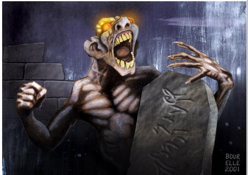
Illustration © 2001, Edward Bourelle

Agarats prefer to fight in close quarters and will always try to close quickly to melee range. Their attacks are fairly straightforward; they try to claw and bite their opponents. An agarat will use its Enervating Scream early in the combat to weaken foes, but is cunning enough to try to catch as many opponents as possible in the range of its scream (see below), waiting a round or two to draw multiple opponents into combat with it.