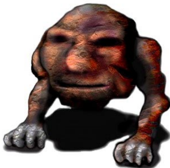
Illustration © 2001, Frederic Simons

Animate Boulders (Sp.): A galeb duhr can animate rocks within 180 feet at will, controlling up to two rocks at a time. The boulder has a move speed of 10 and fights as a galeb duhr in all respects. Animated boulders lose their ability to move if the galeb duhr who animated them is incapacitated or moves out of range.