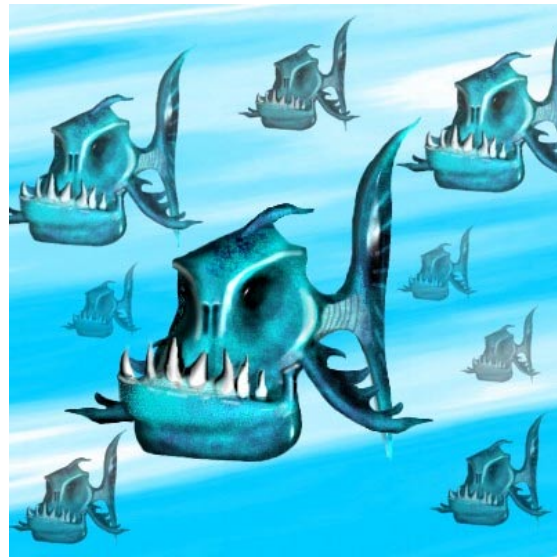
Illustration © 2001, Frederic Simons

Swarm Attack (Ex): Attacking in concert allows the water elemental beast to flank an opponent as long as at least 2 beasts share the square with the opponent.