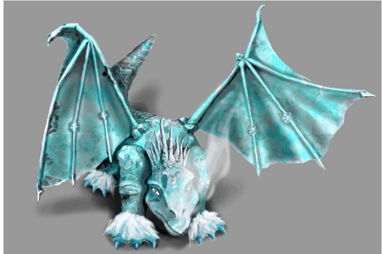
Illustration © 2001, Frederic Simons

Cold Subtype (Ex): Frost drakes are immune to cold. They take double damage from all fire-based attacks unless a saving throw is allowed, in which case they take half damage if they successfully save (otherwise they take double damage).