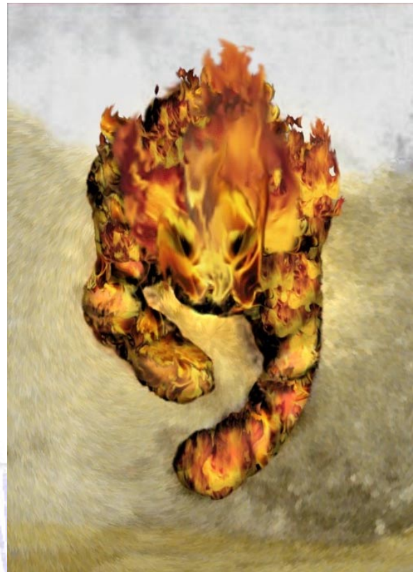
Illustration © 2001, Frederic Simons

In combat, a fire elemental beast tries to cause as much havoc as possible. It uses its breath weapon as often as it can in order to set objects (and opponents) ablaze. It prefers to pounce upon its opponents, then breathe fire into the center of a group. Fire elemental beasts prefer close-in fighting, where their fiery bodies can cause more harm to opponents.