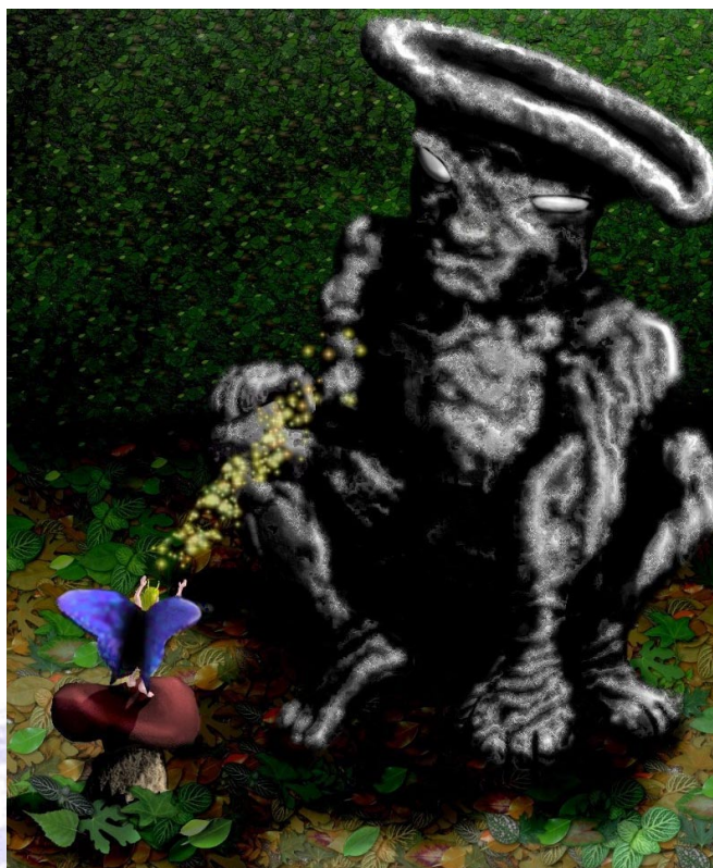
Illustration © 2001, Frederic Simons

Spongy Body (Ex): Because a fungoid's body is spongy and yields when hit, bludgeoning weapons inflict only half normal damage.