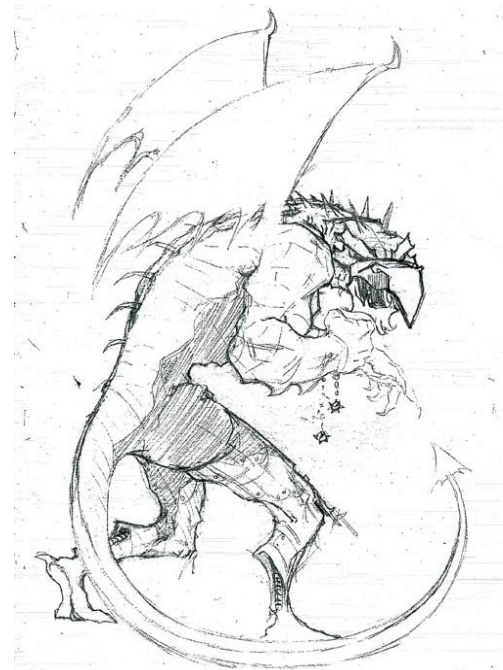
Illustration © 2001, Scott Purdy

An iron gargoyle can fly, but does not fight particularly well when airborne. When possible, it will attempt to fly a short distance and then use its Crush attack (see below) against an opponent by landing on it. If forced to fight an airborne opponent, the iron gargoyle uses its breath weapon and tail, trying to force its airborne opponent into a crash landing due to being stunned.