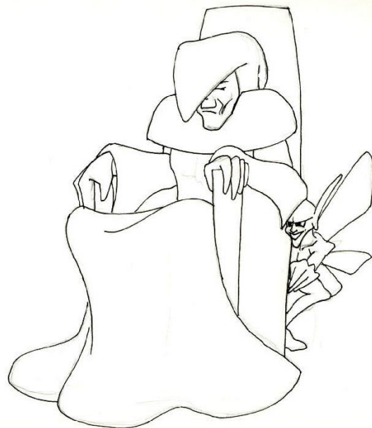
Illustration © 2001, JT Baldwin

A philosopher appears as a seated, grey, insubstantial, robed figure, deep in thought. Its immersion in contemplation is so complete that it neither physically attacks nor defends itself. Until it is actually destroyed, nothing can interrupt ruminations of a philosopher. When its moment of destruction comes, however, it looks into the eyes of its killer with an expression of malicious enlightenment on its face and then vanish with a scream of evil delight. All malices created by a philosopher immediately vanish when the philosopher is destroyed.