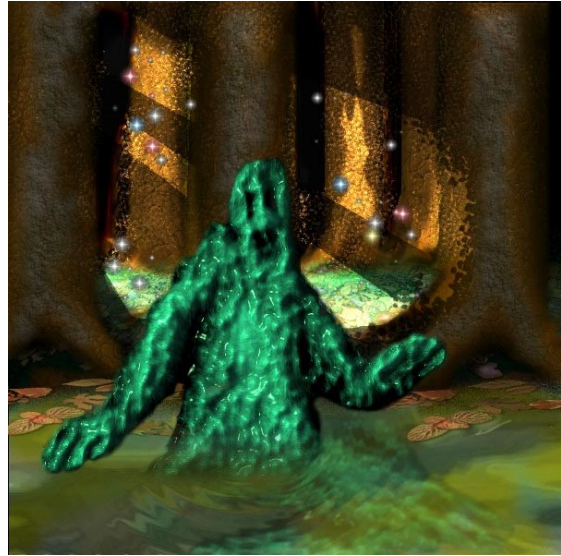
Illustration © 2001, Frederic Simons

Skills: The algoid receives a +4 racial bonus to Hide, Listen, and Move Silently checks. *They receive a +12 racial bonus to Hide checks when in a swampy or forested area.