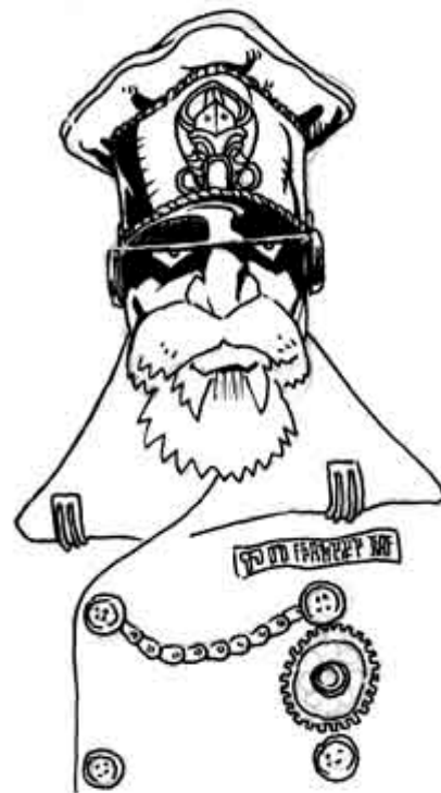
Lord Captian Vizlani